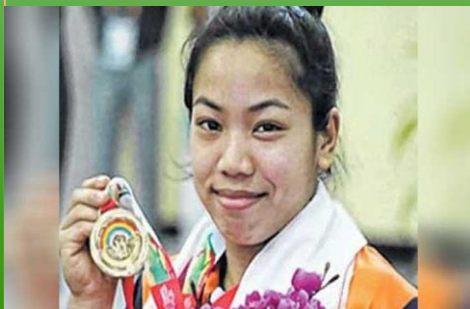
Wightlifter Mirabai Chanu wins Silver in Tokyo Olympics.