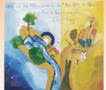
Pooja Shree Gr.XII