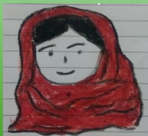
Sai Tamil Gr.4 With guns you can kill terrorists, with education you can kill terrorism.