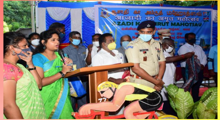
Teachers compering the event