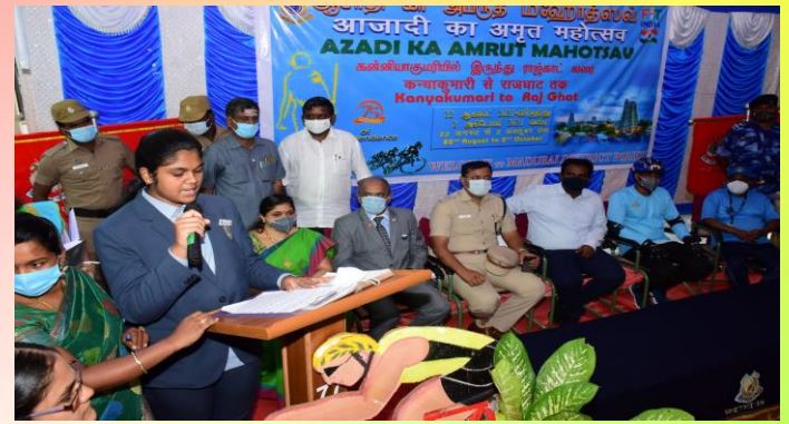
Evangeline SPL KMR welcomes the gathering