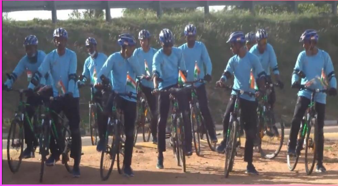
Jawans at our KMR School