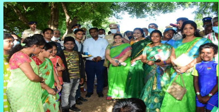
Our staff with District Collector & Police officers