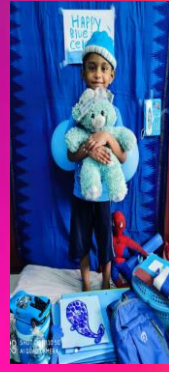
SS Hurshit LKG