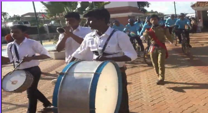
Students welcome the Jawans with their band music