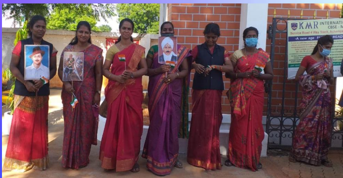
Teachers welcome the Jawans