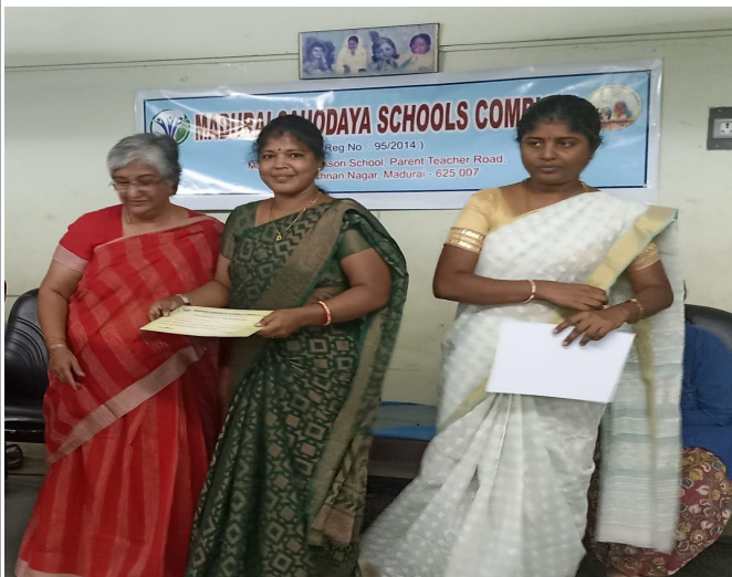
Our Teachers @ SAHODAYA

W hen You E nter this L oving school C onsider Yourself O ne of the special M embers of an E xtraordinary family