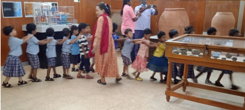
LKG kids visited Madurai City & Gandhi Museum on 9.7.24