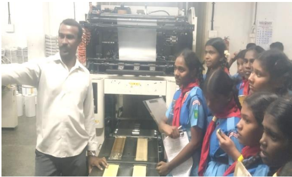
Gr. 8 students visited DinaThanthi Newspaper Press, 12.7.24