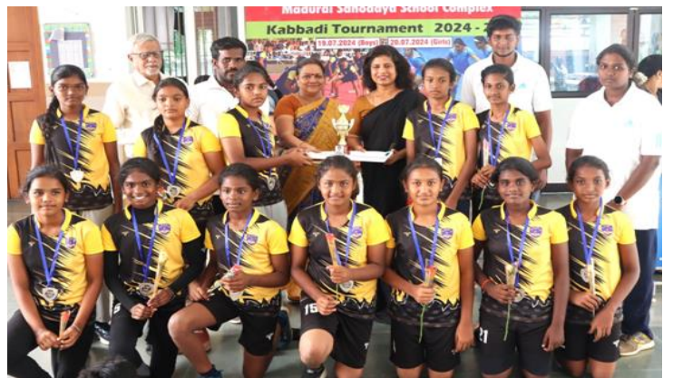
Kabaddi – Runner : Under 14 category