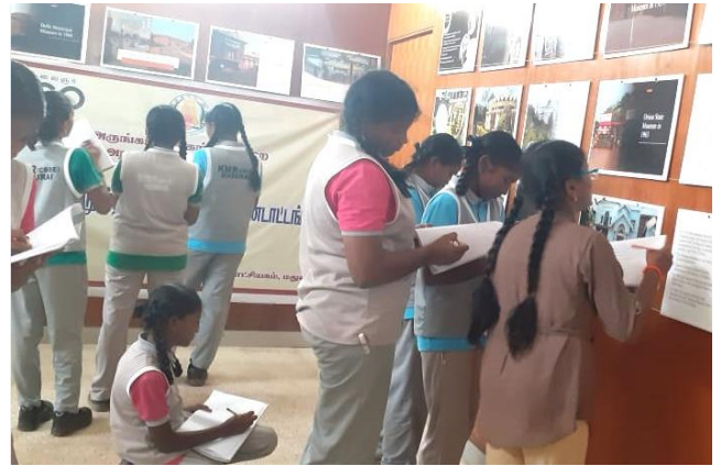
Gr. 7 students visited Gandhi Museum – 9.7.24