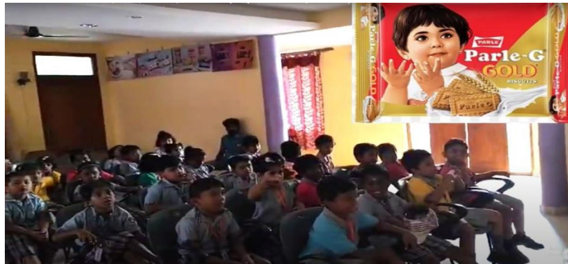
Grade 1 students visited Buscuit Co. on 18.7.24