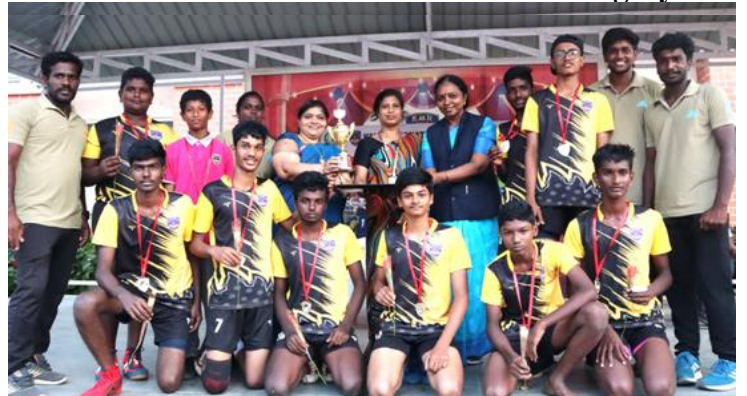
Kabaddi – Winners : Under 17 category