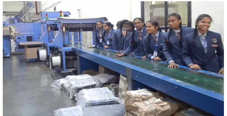
Gr. 11 students visited The Hindu N.paper Press, 26.7.24