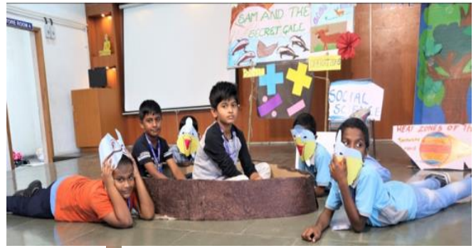
Patha Pooja was performed to the Parents by our Tiny tots