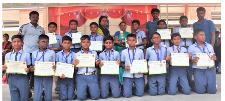
Throwball – Runner : Under 12 category