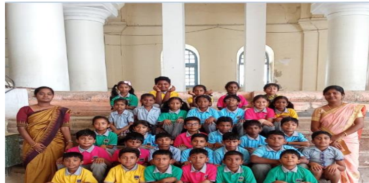
Gr. 3 students visited Thiru Malai Naya kar Mahal, 9.7.24