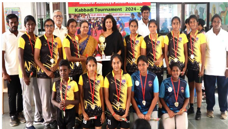
Kabaddi – Winner : Under 17 category