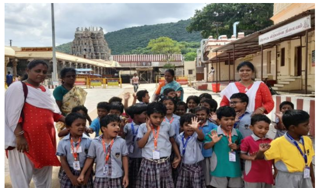
UKG kids visited Alagar Koil on 11.7.24