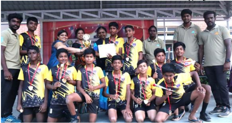
Kabaddi – Winners : Under 14 category