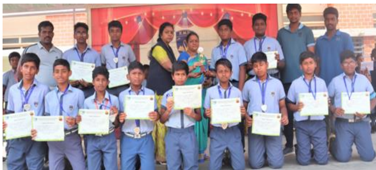
Throwball – Runner : Under 14 category