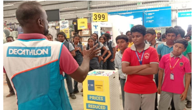
Gr. 9 students visited B'Forest, Decathlon - 11.7.24