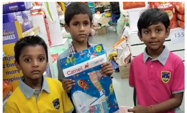
Grade 2 students visited Smar Bazaar, 9.7.24