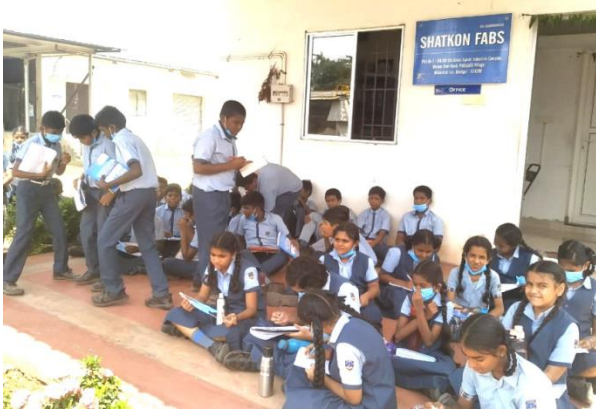
Gr. 6 students visited Shatcon Fabrics – 10.7.24