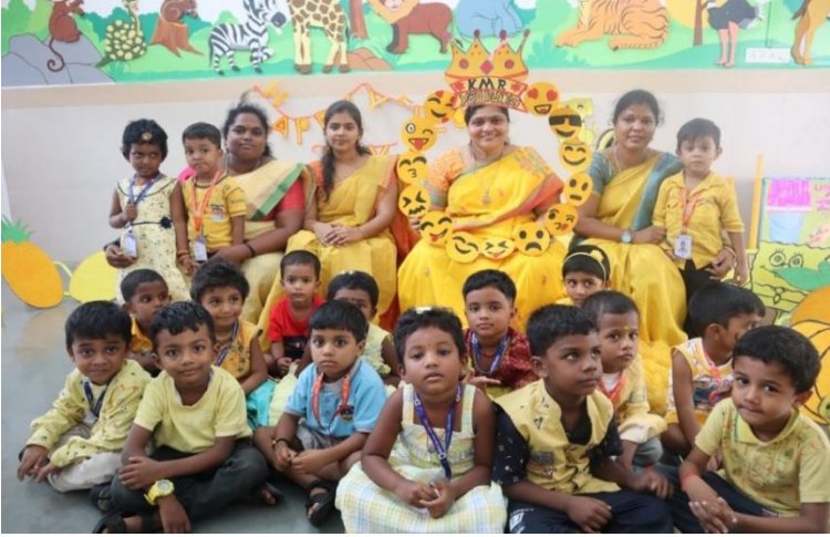
Yellow Day - KG Children - 25.07.24 YouTube Link